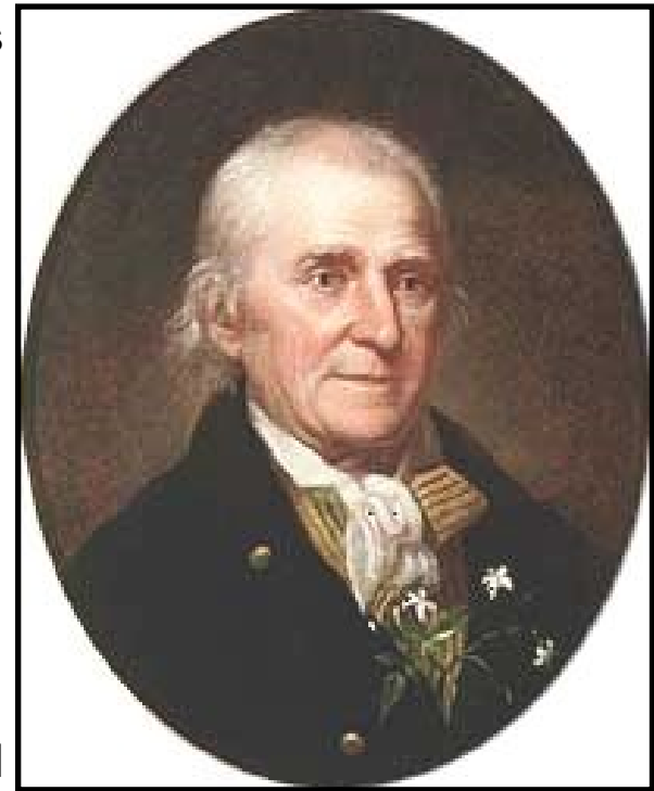
William Bartram (Portrait by Charles Willson Peale,)

William Bartram was a botanist, ornithologist, and natural historian who traveled extensively throughout the early period of the United States. His excursion into today's Pintlala is noted by some chronologists as July 20, 1775 with some latitude. It is stated that he crossed Pintlala Creek near the present day town of